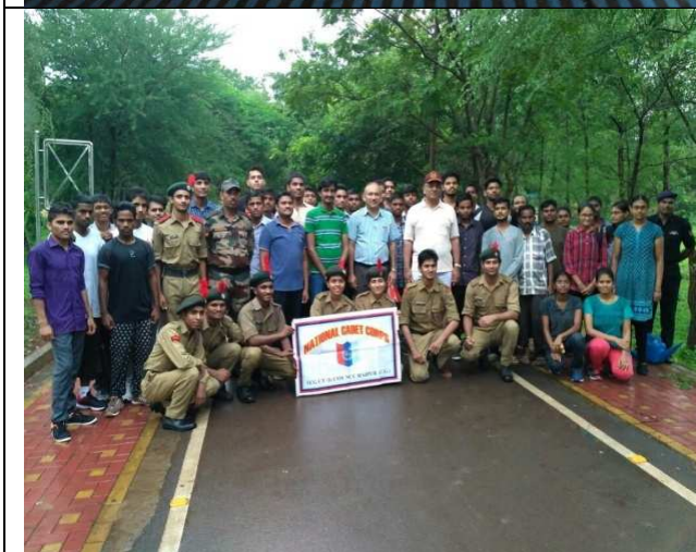
Samplng Of Plants On (06-07-2017)