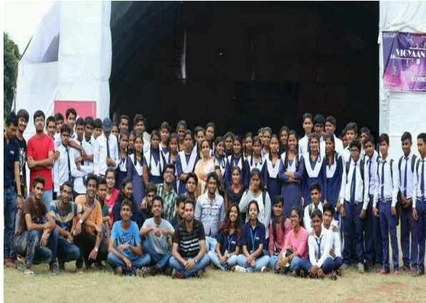
UBA with NCC on 12-03-2018