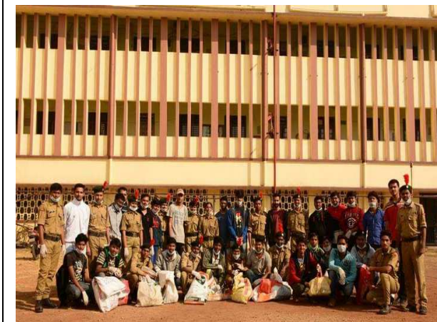
Campus Cleaning campaign by NCC with Go-green committee on 03-02-2018