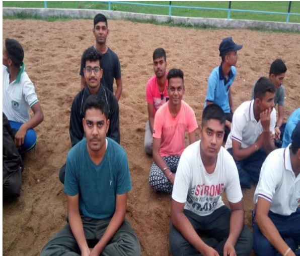
Sainik Camp (01-07-2018 to 10-07-2018)